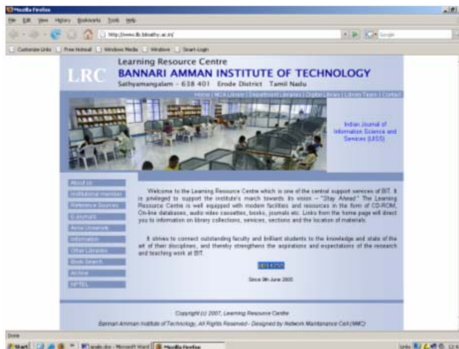
Fig.1 Library web portal of Bannari Amman Institute of Technology