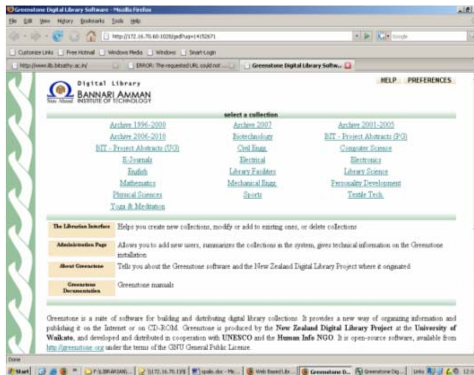
Fig.2 Web Based Library Services of Bannari Amman Institute of Technology

Considering the growing impact of Information and Communication Technologies (ICT), Web technologies and Database technologies, the Bannari Amman Institute of Technology has set up a Digital Library in early 2005 to disseminate web based library services to the right reader at the right time