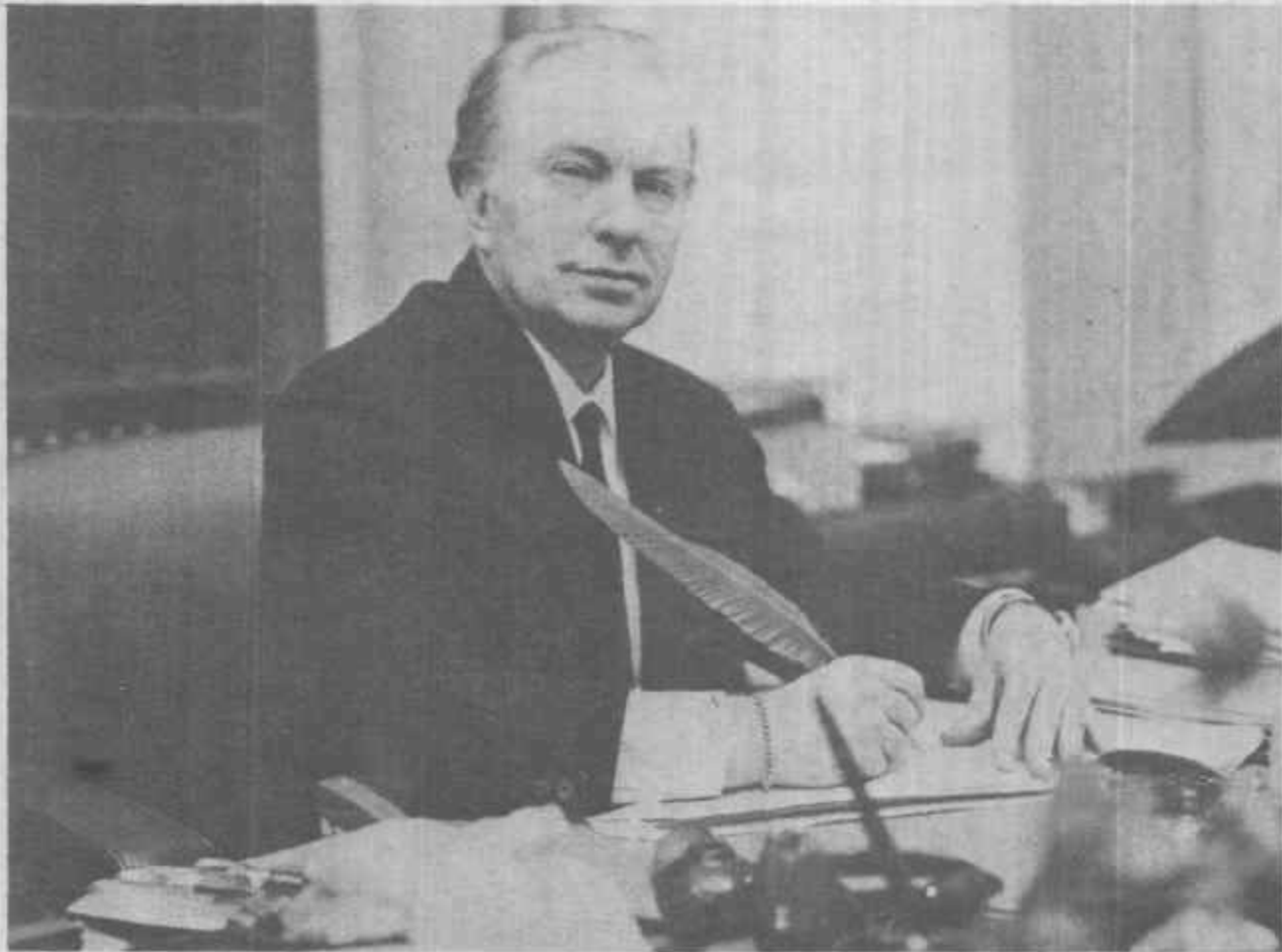
L. Ron Hubbard, Founder

Then you come back and look at it again and you realize you can look over any state or organization and look over their various parts, find out the parts that are missing and estimate at once the degree of weakness or chaos which exists internally.