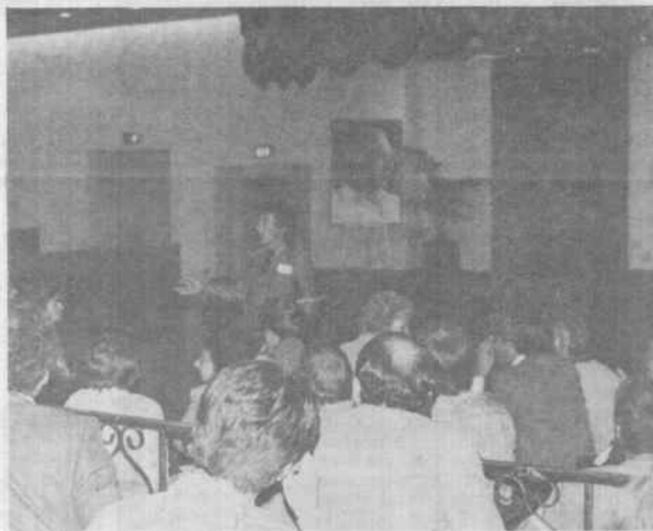
The meeting was attended by many, and plans were made for further meetings as well as new chapters of the IPA.